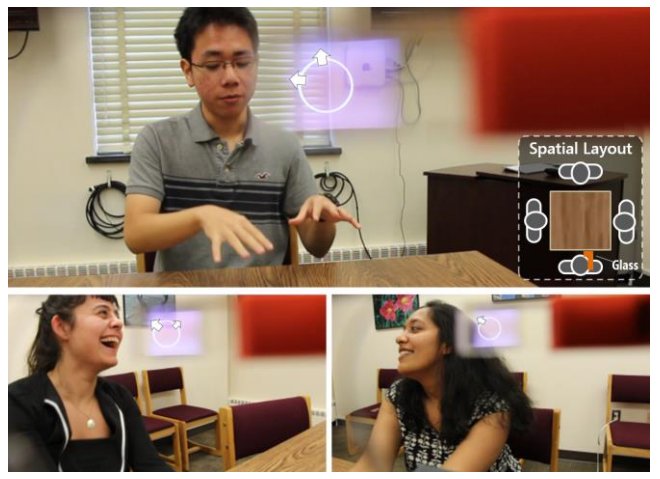
Figure 1: Our proof-of-concept in use during a group conversation with four people. The wearer (not shown) is seated at the south end of the table. Arrows on the transparent HMD (Google Glass) direct attention toward active speakers. Arrow size indicates loudness. See supplementary video.

http://dx.doi.org/10.1145/2702123.2702393