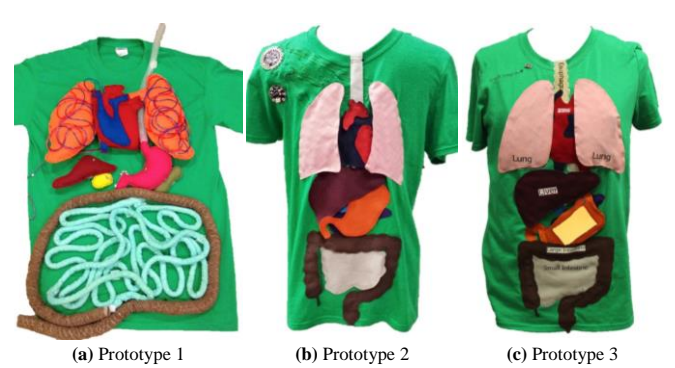
Figure 2: Design evolution of the three prototypes.

Table 1: Our seven BodyVis design goals.