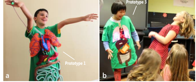
Figure 1: BodyVis is an interactive e-textile shirt for body learning that actively responds to the wearer's physiology and visualizes their body data on externalized anatomical models. Prototypes 1 and 3 shown above.

Permission to make digital or hard copies of all or part of this work for personal or classroom use is granted without fee provided that copies are not made or distributed for profit or commercial advantage and that copies bear this notice and the full citation on the first page. Copyrights for components of this work owned by others than ACM must be honored. Abstracting with credit is permitted. To copy otherwise, or republish, to post on servers or to redistribute to lists, requires prior specific permission and/or a fee. Request permissions from permissions@acm.org. CHI 2015, April 18 - 23 2015, Seoul, Republic of Korea Copyright is held by the owner/author(s). Publication rights licensed to ACM. ACM 978-1-4503-3145-6/15/04...$15.00 http://dx.doi.org/10.1145/2702123.2702299