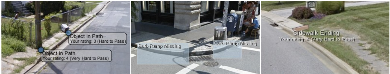
Figure 1. Using crowdsourcing and Google Street View images, we examined the efficacy of three different labeling interfaces on task performance to locate and assess sidewalk accessibility problems: (a) Point , (b) Rectangle , and (c) Outline . Actual labels from our study shown.

Kotaro Hara, Victoria Le, and Jon Froehlich Human-Computer Interaction Lab Computer Science Department, University of Maryland College Park, MD 20742 {kotaro, jonf}@cs.umd.edu; vnle@umd.edu